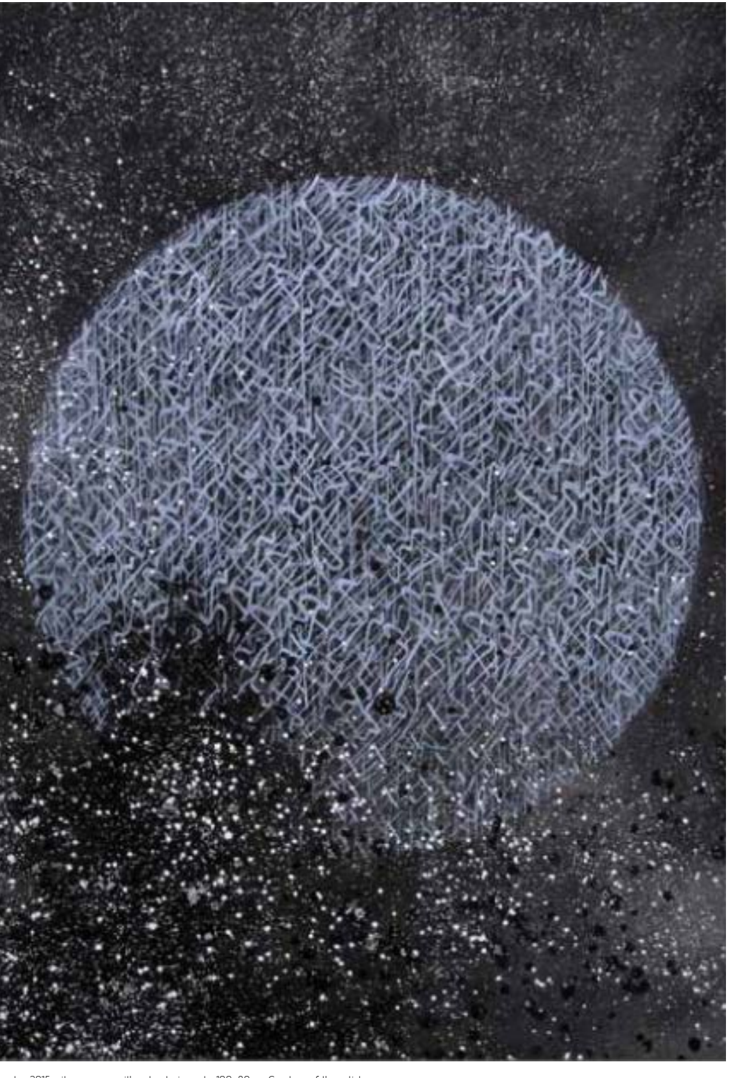
Baraka, 2015, oil on canvas with natural pigments, 100x80cm.