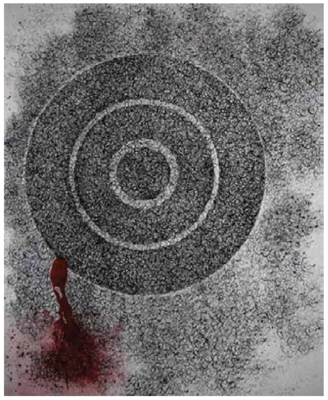
Hob/amour/Love, 2015, oil on canvas with natural pigments, 230x185cm.